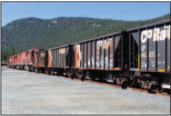
Then it's back down to view a ballast train get loaded.