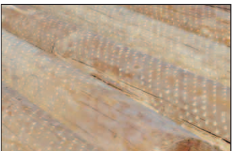
The incising penetrates the wood surface to approximately 1/8 inch, allowing for additional preservative protection in the groundline area.