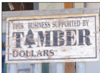
...they were really glad our members produce wood cross ties.