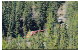
...we traveled west through the mountains to the famous CPR spiral tunnels. We timed it just right and got to see a long west bound train snake its way through the tunnels heading to Vancouver.