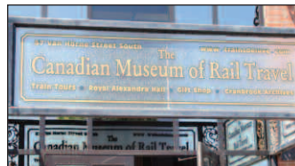
During another quick stop along the way to the next CPR facility, we get to tour several vintage Canadian Pacific railcars in Cranbrook.