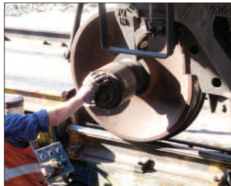
Using a specially built hydraulic table to dismount a wheel set...