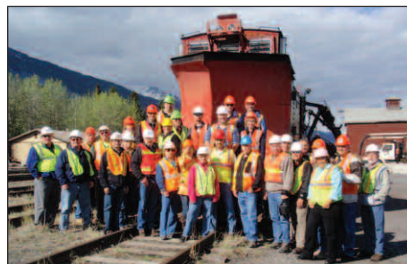
Our first group picture, taken before we drove through the town of Banff in route to Morant's Curve.