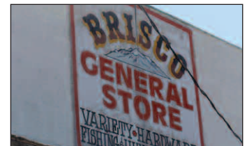
Along the way to our next stop, we found the Brisco General Store, where...