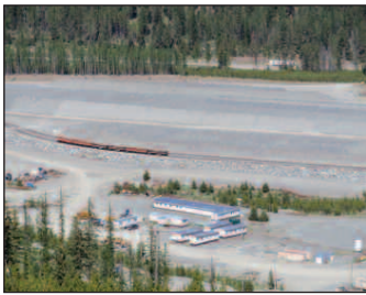
Then, it's to the top of the mountain where you can see the massive amount of ballast in inventory and...