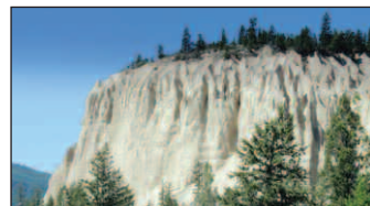
Now, driving through eastern British Columbia the scenery changes. Out of the bus window, we see many hoodoos.