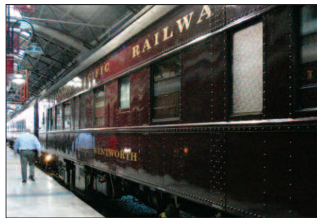
And it didn't end there. The entire group was treated to a full tour of the CPR fully restored business cars...