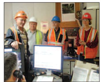
Keeping track of where the cars are in the process that go in for servicing is taken care of in this office—and it's a tightly run ship.