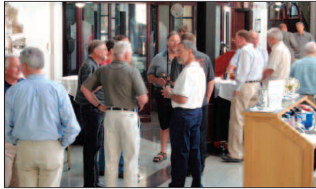
An evening reception before the field trip was sponsored by Canadian Pacific Railway.