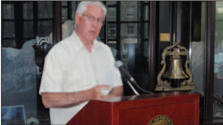
...both of whom spoke to the members in attendance...