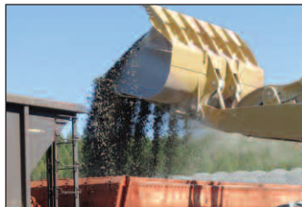
And what a job it is loading 37 tons of ballast in just a couple of minutes.