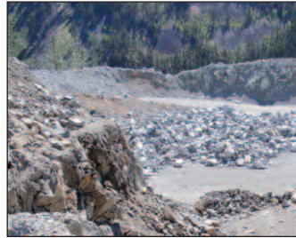
...where it comes from. This facility is taking off the top of the mountain in its drive for the perfect railroad ballast