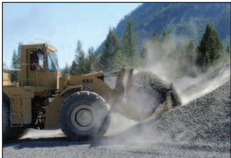
A large front end loader is the vehicle of choice for this job.