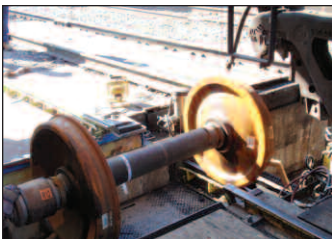
...the same table is used to raise the new wheel set into place to be installed.