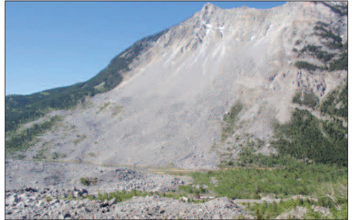
This looks like a ballast quarry, but it isn't. The bus stopped here at Turtle Mountain near Fernie, B.C., for a photo-op. In 1903, in the middle of the night, in just 90 seconds, this whole side of the mountain came crashing down on the town of Frank, B.C., killing 70 of the 100 people in its path. The "ballast" it left covered three square kilometers. If you look very closely near the center of the picture, at the bottom of the shot, you can see a truck (red cab, double trailer). This gives you a perspective on the size of this catastrophe.