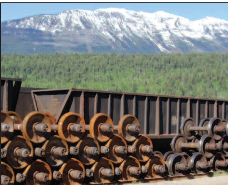
Wheel sets can be changed out at this facility.