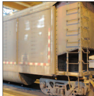
One of the coal cars in for renovation is shown here.