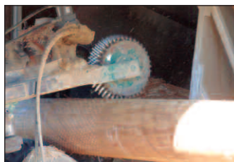
Western Red Cedar poles are prepared for treating. Most specifications call for groundline incising.