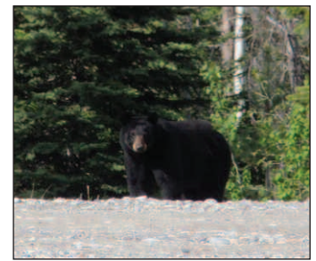
That evening we stayed in Golden and were joined for dinner by one of the locals.