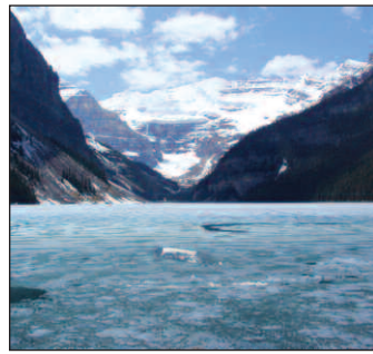
After a quick rest break at Lake Louise and then lunch...