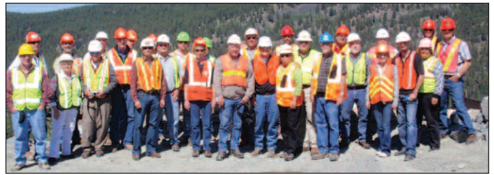
Another group photo for the record.